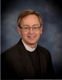
From the P astor

31 The days are surely coming, says the LORD, when I will make a new covenant with the house of Israel and the house of Judah. 32 It will not be like the covenant that I made with their ancestors when I took them by the hand to bring them out of the land of Egypt—a covenant that they broke, though I was their husband, says the LORD. 33 But this is the covenant that I will make with the house of Israel after those days, says the LORD: I will put my law within them, and I will write it on their hearts, and I will be their God, and they shall be my people. 34 No longer shall they teach one another or say to each other, “Know the LORD,” for they shall all know me, from the least of them to the greatest, says the LORD, for I will forgive their iniquity and remember their sin no more.